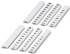
Zack marker strip flat, 10-section, vertically labeled with the consecutive numbers: 1 ... 10, white

Please be informed that the data shown in this PDF Document is generated from our Online Catalog. Please find the complete data in the user's documentation. Our General Terms of Use for Downloads are valid ( http://phoenixcontact.com/download )